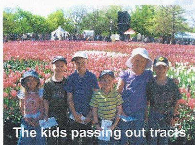
The kids passing out tracts